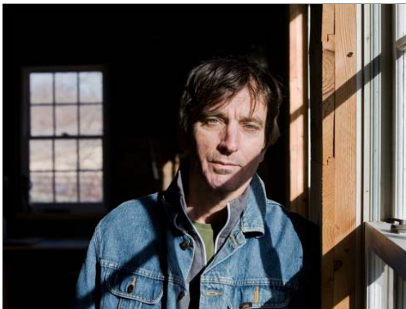
Nick Flynn, above, and Ron Rash, below, are two of the many authors who will take part in this year's Spring Literary Festival at Western Carolina University. Rash's novel, "Serena," set in Haywood County, will soon be a motion picture.

Nick Flynn will close the festival with a reading at 7:30 p.m. March 22 in the recital hall. Flynn's 2004 memoir recounts the author's encounter with his long-absent father while working in a Boston homeless shelter. The work was adapted and recently released as the feature film "Being Flynn," directed by Paul Weitz and starring Robert De Niro, Paul Dano and Julianne Moore. Flynn authored a second memoir, "The Ticking Is the Bomb," which was published in 2010, and a companion collection of poems in 2011.